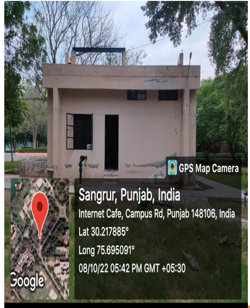
FRESHWATER PUMP HOUSE